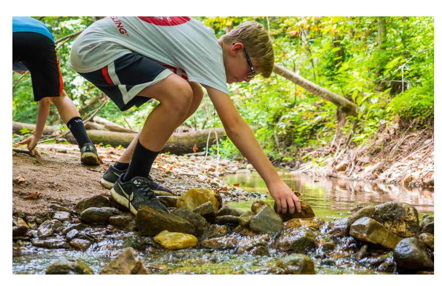
Exploring Purgatory Creek, a camper finds macroinvertabrates, evidence of a healthy stream.

A summer project of the Media Coordinator, our TikTok features short and silly videos about camp. Follow us @campaltamons to see funny reels and highlights from the summer and the rest of the year.