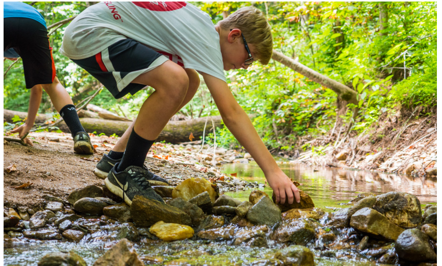
Exploring Purgatory Creek, a camper finds macroinvertebrates, evidence of a healthy stream.

A summer project of the Media Coordinator, our TikTok features short and silly videos about camp. Follow us @campaltamons to see funny reels and highlights from the summer and the rest of the year.