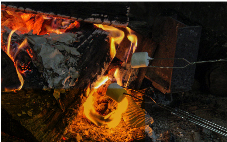
Guests roast marshmallows over a campfire.

We are grateful for the many volunteer hours put in on various projects like our Paul Bunyan day where most of the wood we need during our camping season is split, as well as cleaning cabins and clearing brush to get ready for our busy camp season. We can't forget the many hours it takes to mow all the grass to keep our grounds looking good.